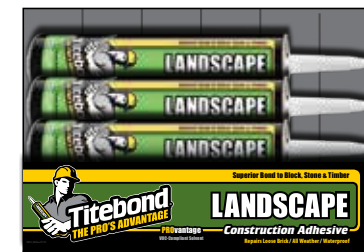
10 oz. Cartridge Bin Basket (12" w x 8" h x 15.25" d) Order # - 17977 One size fits all 10 oz. cartridges.