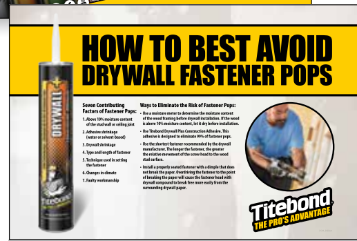
Counter Mat (18" w x 12" h) Display the Titebond construction adhesive line on counter space.