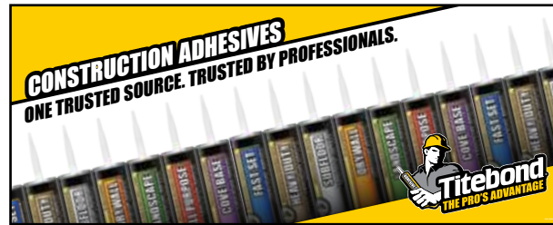
Vinyl Banner (60" w x 24" h) Can be displayed in-store to showcase the Titebond brand of construction adhesives.

All merchandisers are ordered on a first come, first serve basis while supplies lasts. Additional lead time should be expected if items are on back order.