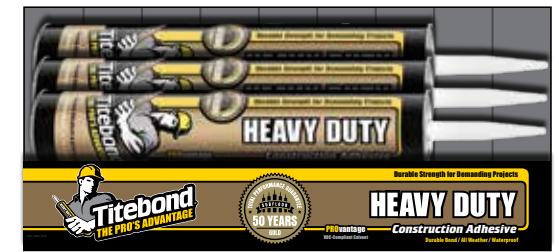
28 oz. Cartridge Bin Basket (18" w x 8" h x 15.25" d) Order # - 17956 One size fits all 28 oz. cartridges.