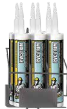
PVC Merchandiser Hanging Grid Rack for Titebond PVC Trim Adhesive & Sealant. Holds one case of product.