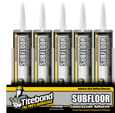
10oz. Vertical Pusher Rack (12" w x 7" h x 14" d) Order # - 17986 Five row pusher rack that holds 30 cartridges.