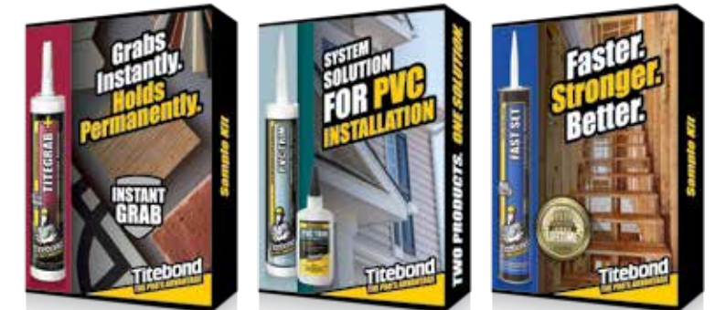
Sales Presentation Kits Ideal for training and potential customers, kits include product samples and other corresponding product literature.